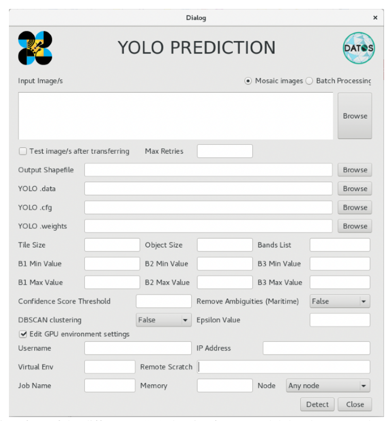
Figure 1. The user interface of the different QGIS plug-ins for AI model development. These plug-ins include a) Training Data Generation, b) U-Net Model Training, c) U-Net Model Prediction, d) YOLO Training, and e) YOLO Prediction.

In navigating the complexities of technology, geospatial science, and data analysis, the team works with common objective: the empowerment of individuals and institutions to leverage AI and RS technologies for the advancement of space science and technology assets and applications in the Philippines.